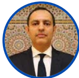
Mr. Younes Sekkouri Minister in charge of Economic Inclusion, Small Business, Employment and Workforce Development.