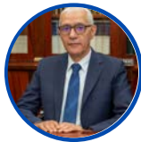
Mr. Rachid Talbi El Alami Speaker of the House of Representatives.